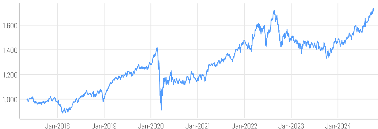
■ Solactive GBS Developed Markets Investable Universe Core Infrastructure EUR Index NTR