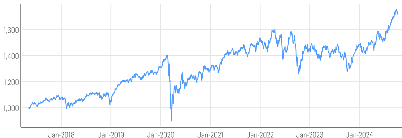
■ Solactive GBS Developed Markets Investable Universe Core Infrastructure USD Index NTR